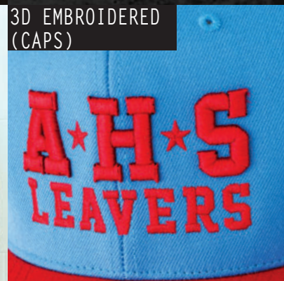
3D EMBROIDERED (CAPS)