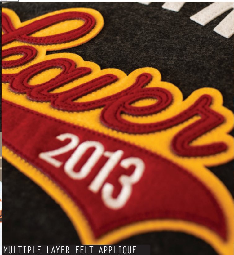
MULTIPLE LAYER FELT APPLIQUE